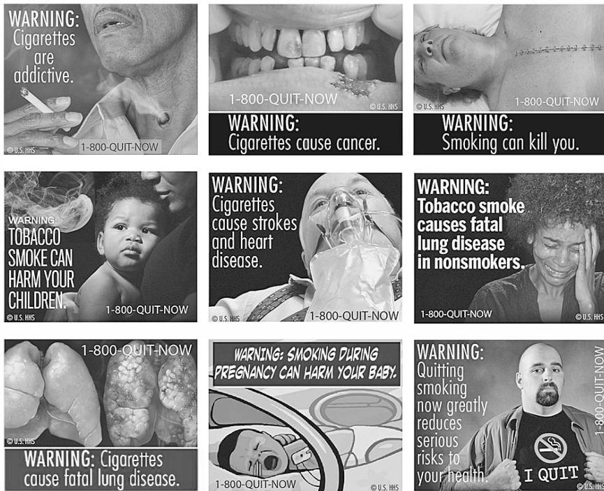
FIGURE 1: THE THE NINE FDA PROPOSED HEALTH WARNINGS REQUIRED ON CIGARETTE LABELS 13

looked the fact that economic theory clearly defines the two governmental interests of reducing smoking and the separate interest of informing consumers of the health risks of smoking. 12