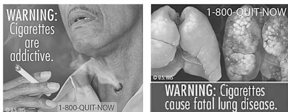
FIGURE 4: IMAGES THAT ACTIVATE SYSTEM II

The second image that likely activates System II is the comparison of a healthy lung and a diseased lung. While the connection between fatal lung disease and the picture of the discolored, diseased lung is not totally clear (it is possible for a non-smoker to have lung disease), it is understandable enough to serve as a stimulus and provoke a consumer to connect the differences between the lungs in the image to the text. That image will likely activate most consumer's System II because some consumers may not realize what stained and diseased lungs look like in comparison to healthy lungs. The image requires a consumer's deliberation to compare and reason through the differences between the healthy lung and the diseased lung presented. It is this effort that activates System II.